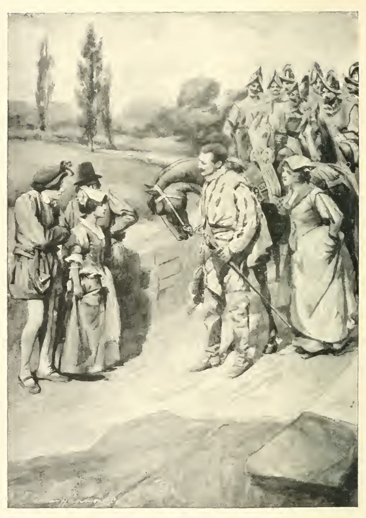
"HE HAD DISMOUNTED, AND HAD HIS HAT IN HIS HAND." [Page 105.